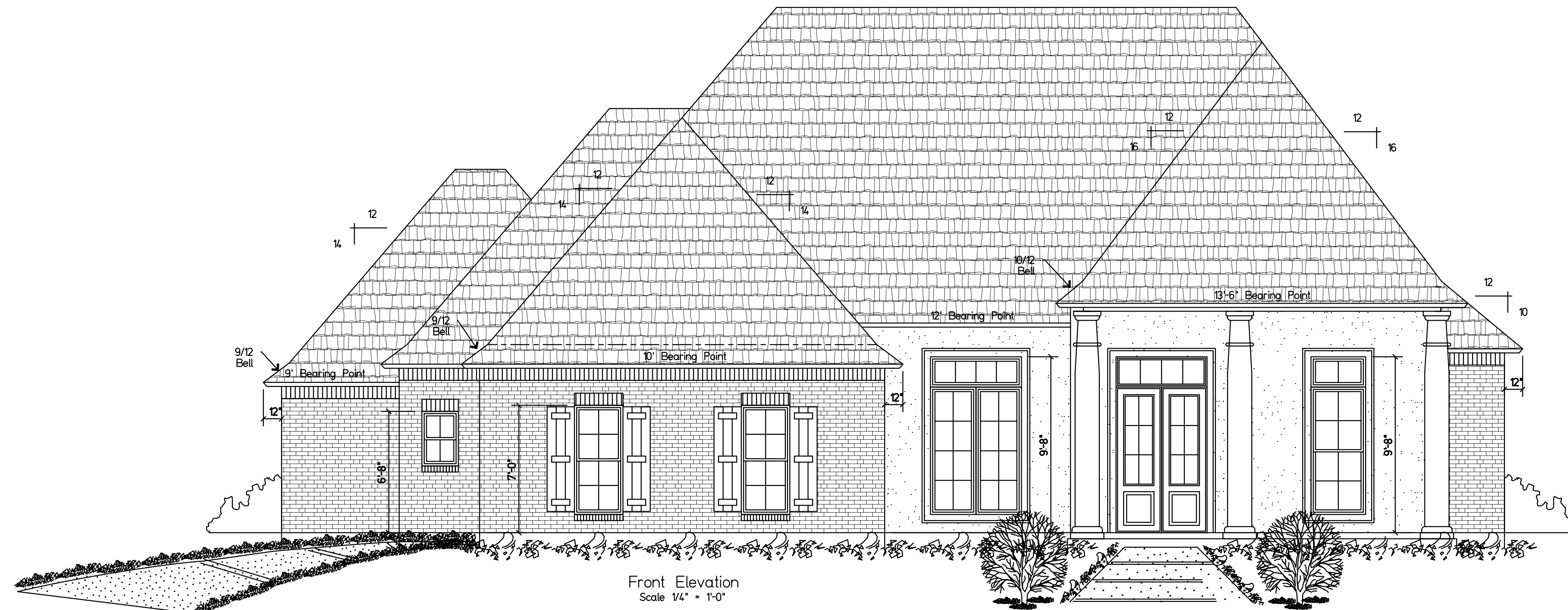
Front Elevation Scale 1/4" = 1'-0"